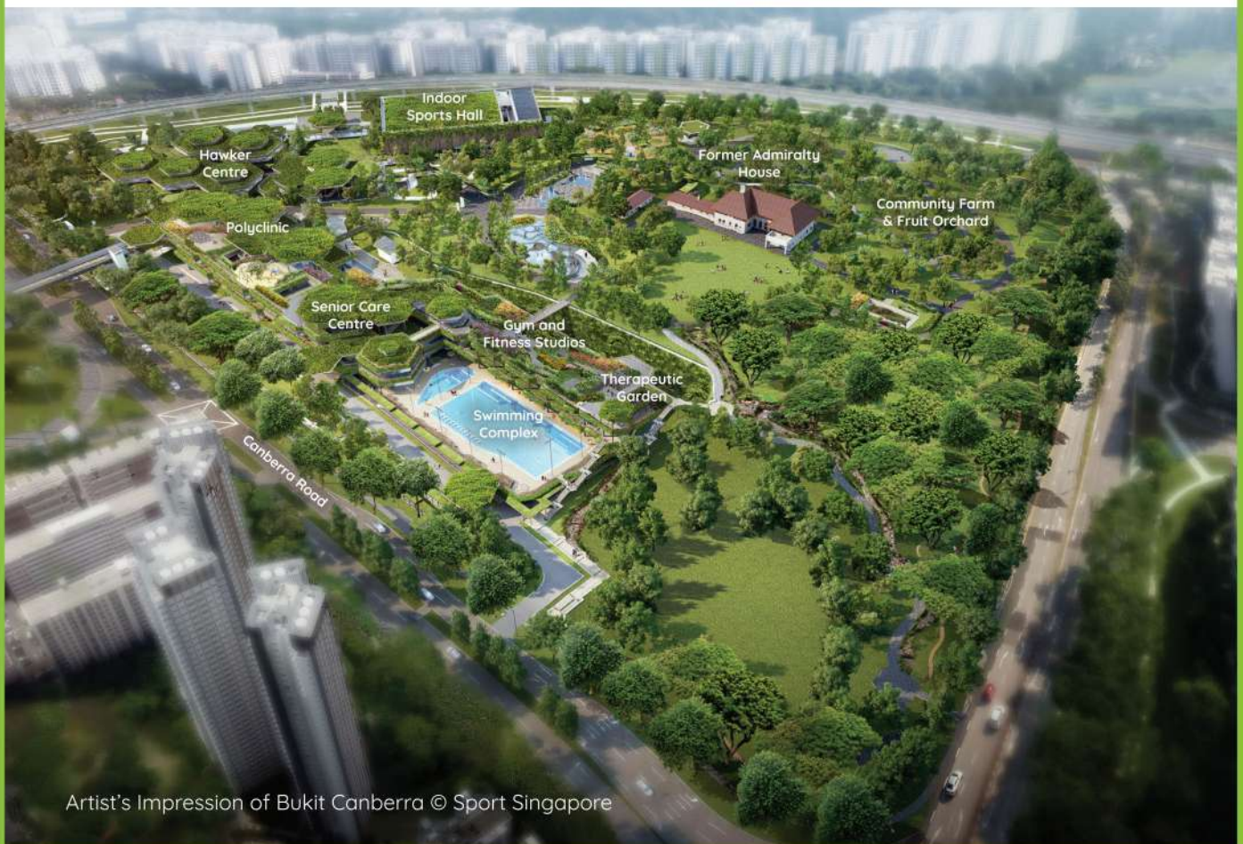
Artist's Impression of Bukit Canberra

Our towns are planned to be liveable and self-sufficient, with easily accessible shops, health care, schools, community facilities and parks. Commercial nodes, industrial estates and business parks within or nearby the town, also help to provide nearer job opportunities for residents. The detailed planning and implementation of plans for each town is a joint effort of many government agencies.